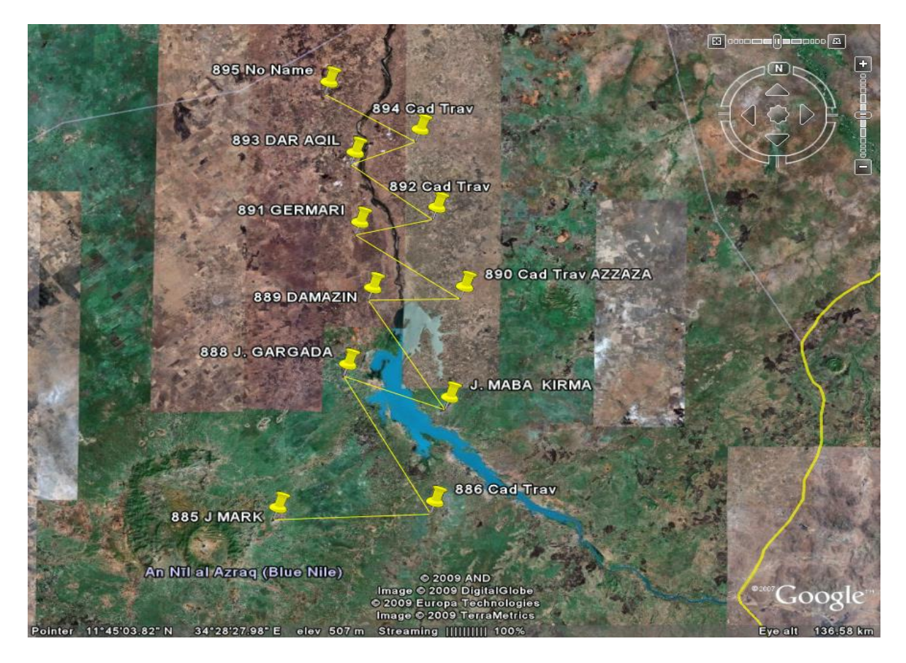
Figure 1 – National Trigonometrical Stations in the Damazin region

This connection was necessary because the irrigation projects being conducted by Lahmeyer International are all in the ADINDAN system and a precise connection to RDHP relevant features (canal headworks, hydrostatic modelling and storage data) was required.