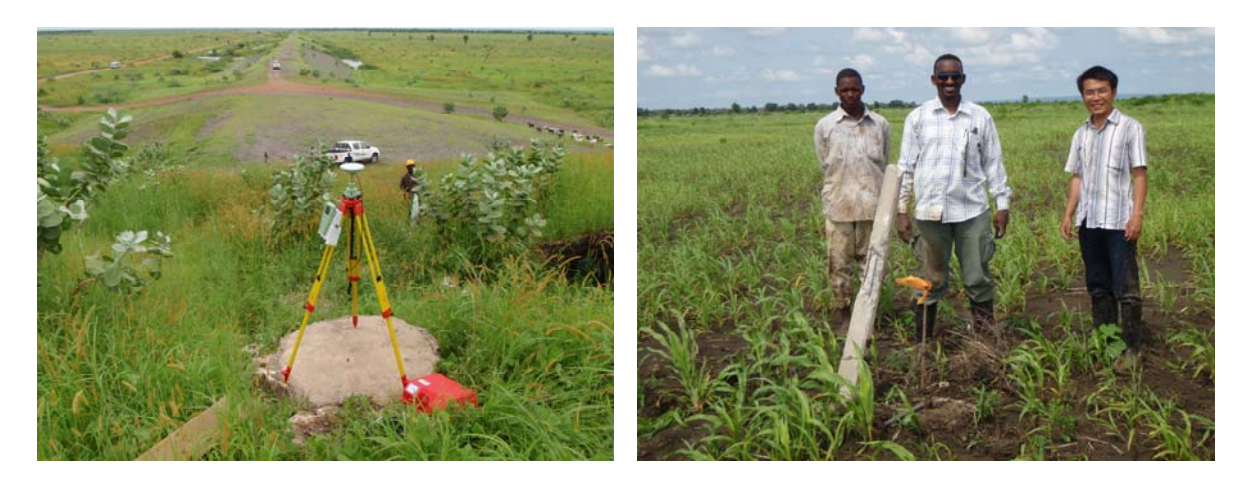
Figure 2 – Station A0 Left abutment

Results from the primary network observations were produced using the AUSPOS internet service provided by the geodesy department of Geoscience Australia, an Australian Government organisation. AUSPOS produces solutions which are in the WGS84 system at the epoch of observation.