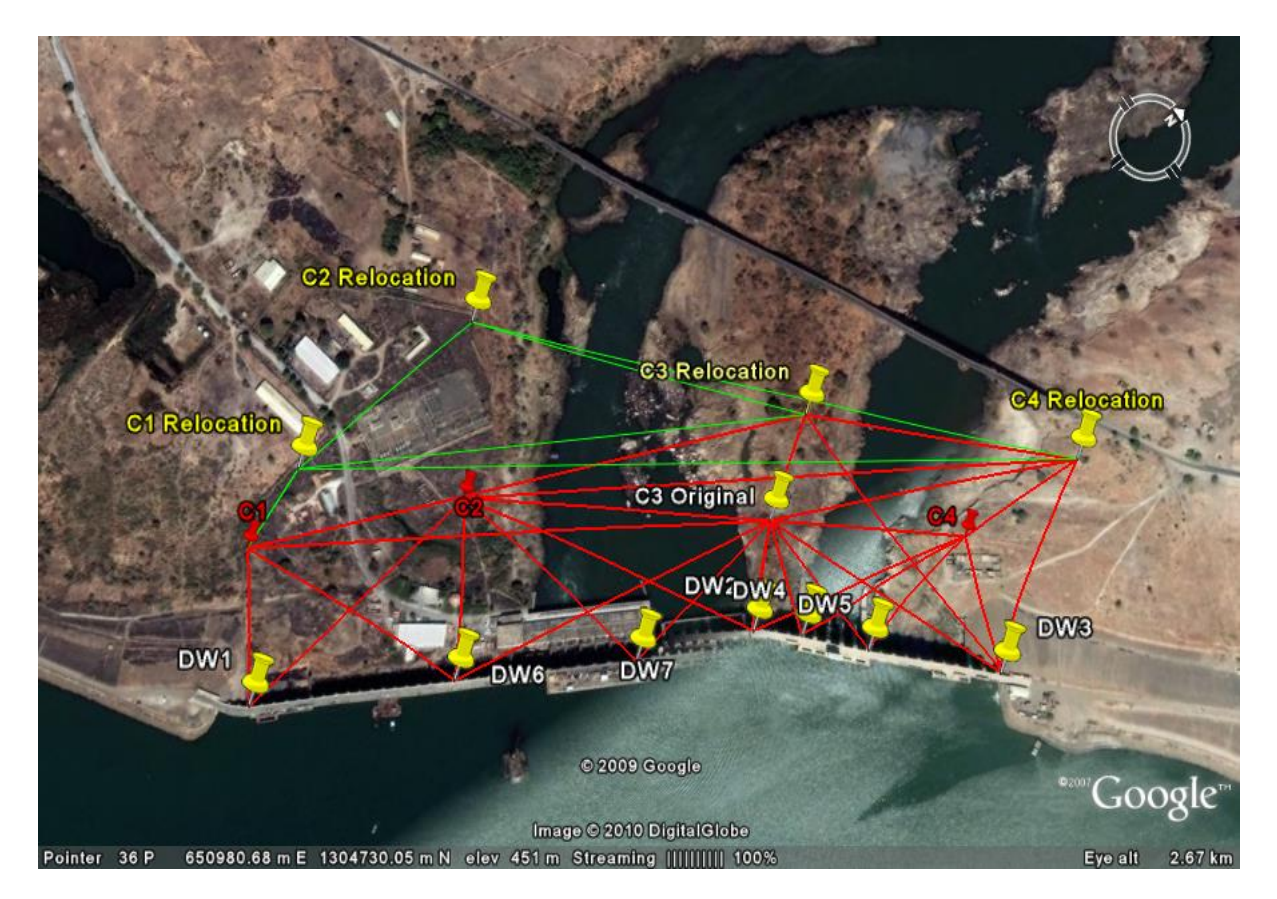
Figure 5 – Concrete Dam Control Stations

The stations C1 and C4 are currently in the proposed canal alignment corridors. The stations C3 and C2, being low and close to the wall, and with the 10 metre increase in the crest level, will produce very steep sightings to the crest works. Therefore all stations are to be relocated as per Figure 5. In March 2009 only the station C4 Relocation had been constructed.